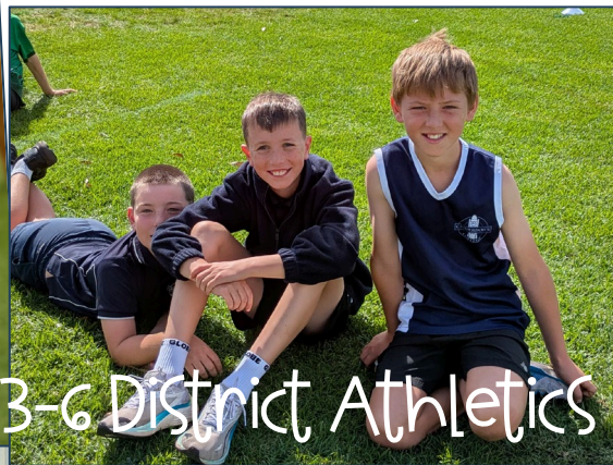
Year 3-6 District Athletics